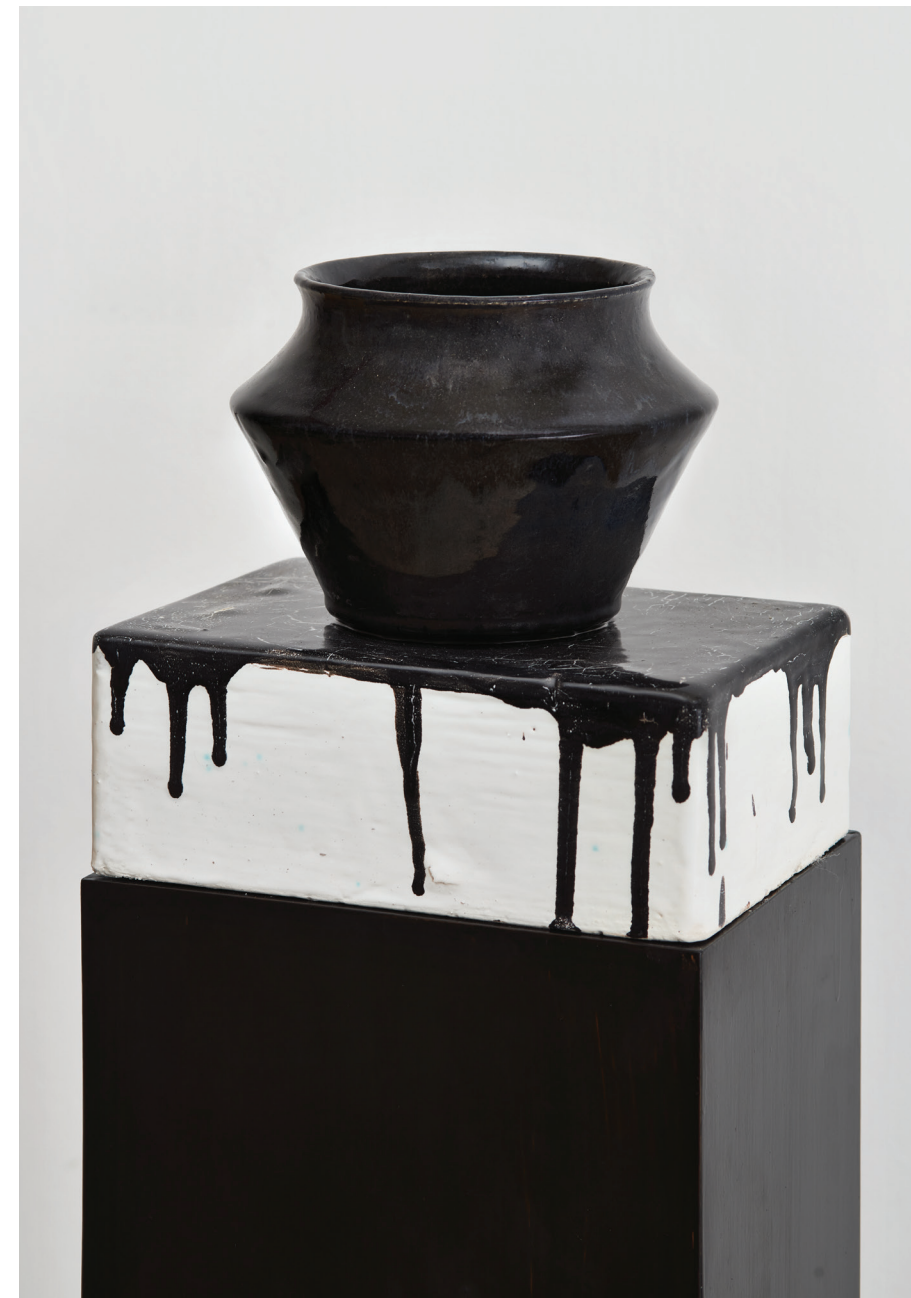
Ceramic Ceramic on wood pedestal 9.5"w x 48"h 6.5"d GW19_2416C1611D-A $15,000