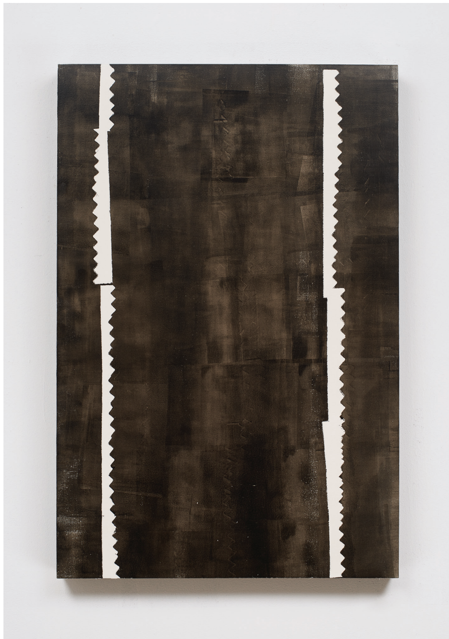
Painting Oil on Panel 24"w x 36"h GW19_2416P0413C-A $20,000